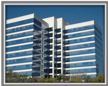
BSK performed complex environmental engineering services turning this former Brownfields site into 3,000,000 square feet of developed land.

Returning abandoned Brownfields properties to vital real estate can be a daunting task. BSK's emphasis on obtaining and using Brownfields funding tools can convert blighted areas into areas of economic opportunity. Our team is nationally recognized for their contributions to Brownfields development practices. We have been supporting clients for over ten years by obtaining funds, developing technical solutions, creating reuse planning, and addressing legal and regulatory concerns.