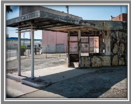
Abandoned Brownfields in every community impacts economic development.